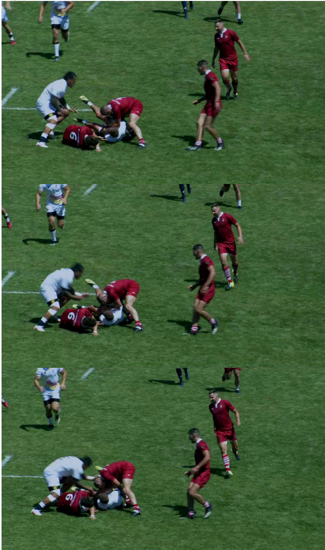
Appendix 1 – Still sequence of the YC1 incident. Angle 1 :