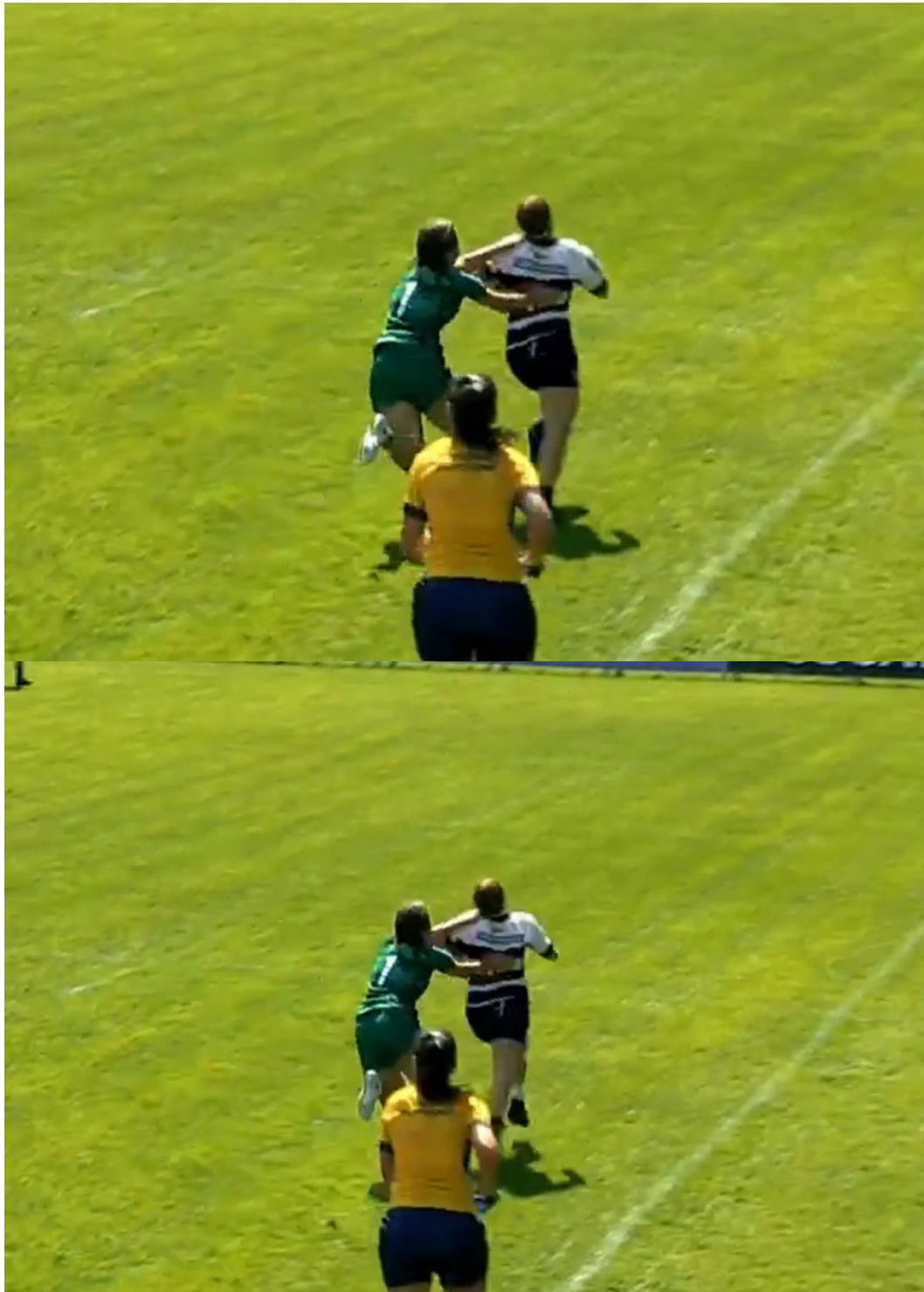
Appendix 1 – Still sequence of the YC2 incident.